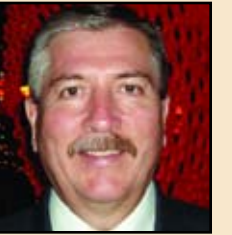
WRITE-IN FRED CHAVEZ COUNTY BOARD DIST. 6