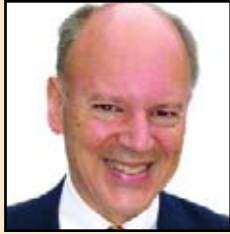
JOE VOSICKY STATE REPRESENTATIVE, DIST. 46