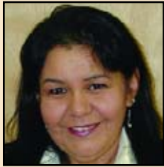
RITA GONZALEZ COUNTY BOARD DIST. 1