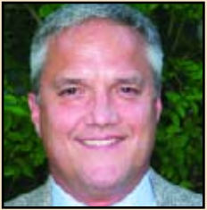
TOM GRIMSTON FOREST PRESERVE DIST. 4

To volunteer or learn more about our candidates, visit www.DuPageDemocrats.org or call (630) 629-1125.