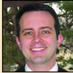
ROB BISCEGLIE STATE REPRESENTATIVE, DIST. 45